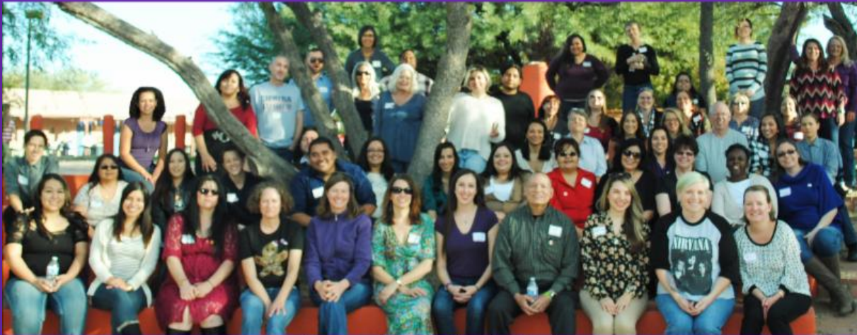
Emerge! Staff Thanks You!